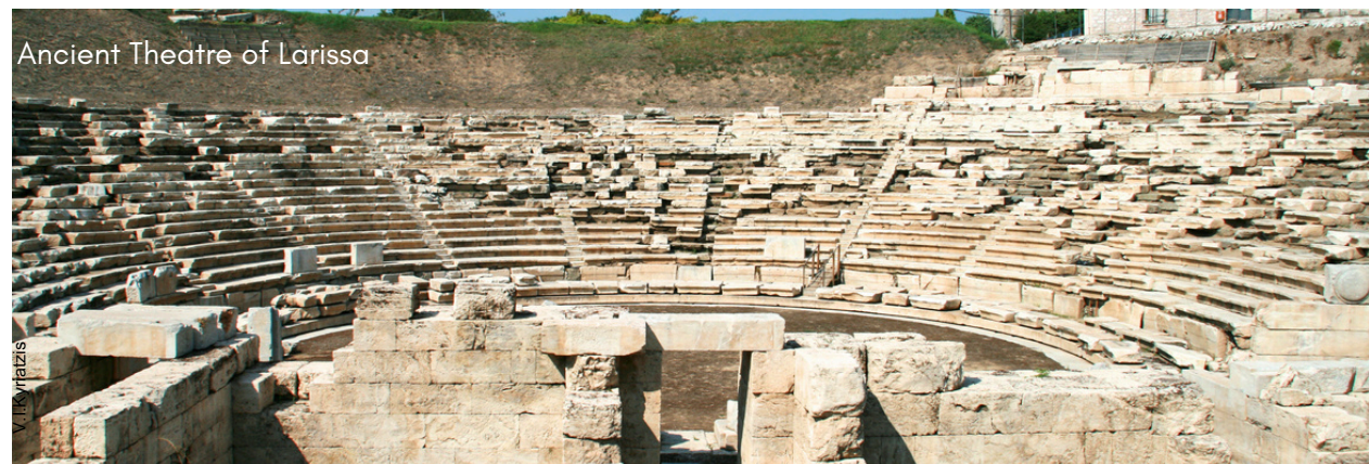
Ancient Theatre of Larissa